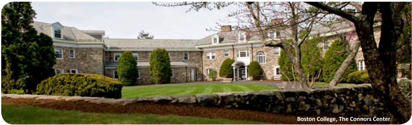
Boston College, The Connors Center