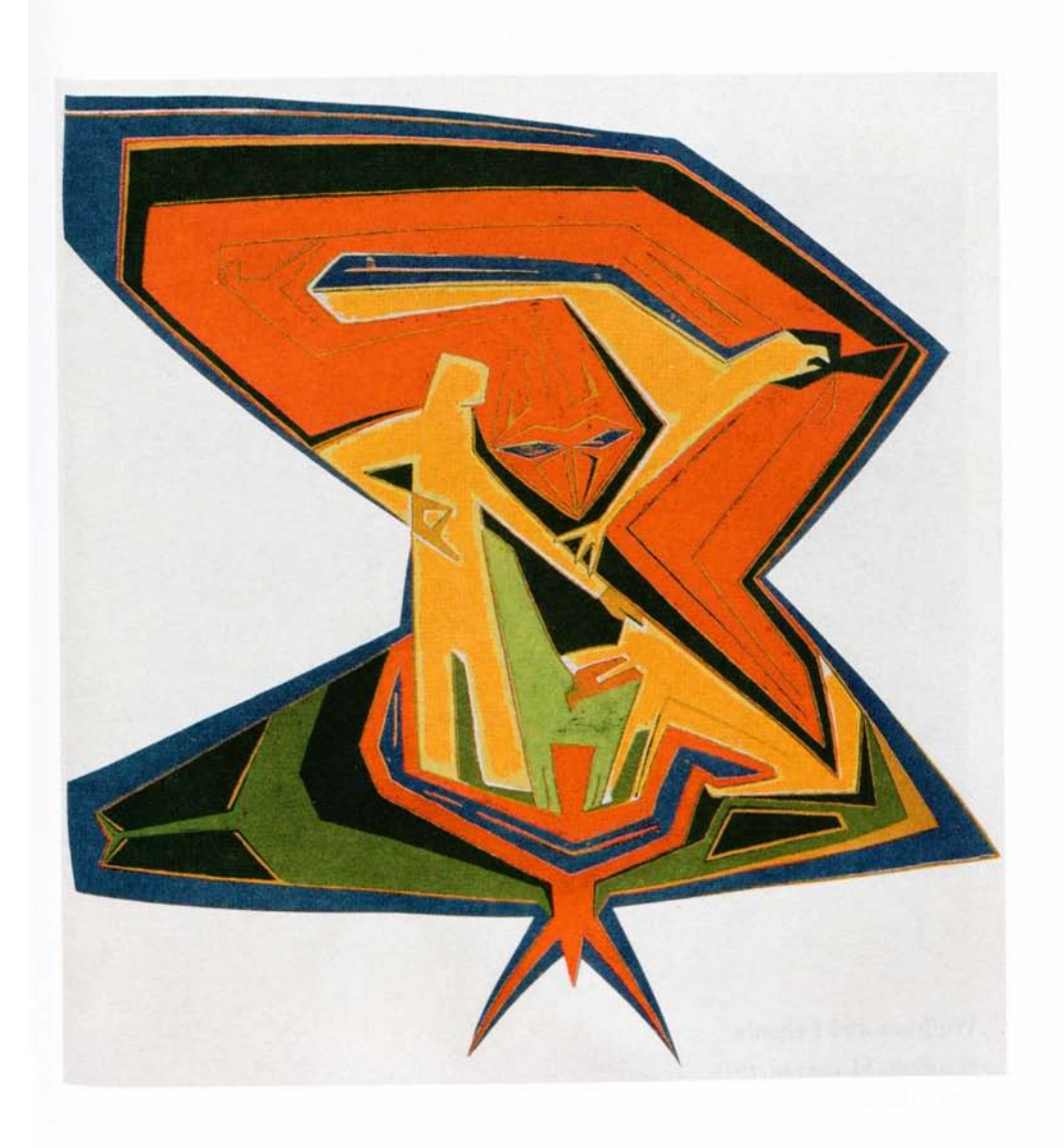
Wo/Man and Friends