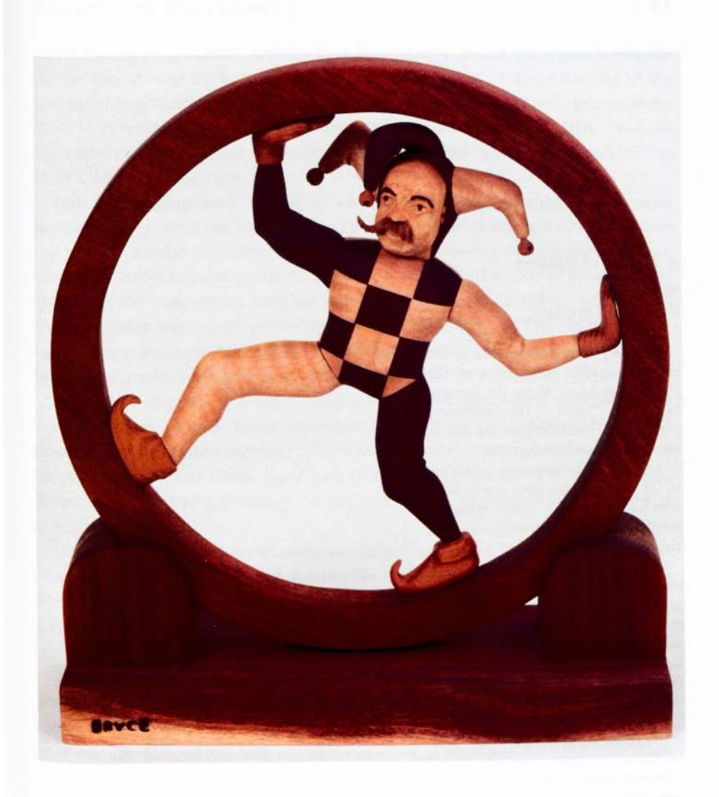
A Matter of Balance